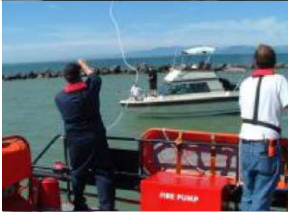
First Nations Fishery