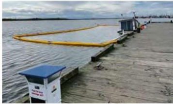
A half-sunken boat was spotted at Steveston’s Imperial Landing.

As it turns out, the vessel is a wooden ex-fishing vessel towed to Imperial Landing after experiencing engine problems on Oct. 22, according to