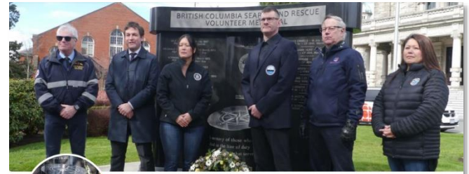
British Columbia Search and Rescue Volunteer Memorial

The Search and Rescue Volunteer Memorial is located on the Legislative Precinct to the east of the back of the Parliament Buildings, along a pathway dedicated to honouring the fallen first responders of British Columbia.