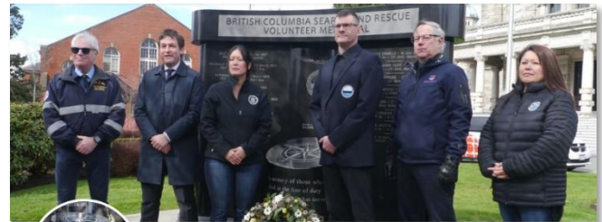
British Columbia Search and Rescue Volunteer Memorial

Today is proclaimed as British Columbia Volunteer Search and Rescue Memorial Day by the Province of British Columbia. Representatives from Royal Canadian Marine Search and Rescue, PEP Air, Coastal Nations Coast Guard Auxiliary, British Columbia Search and Rescue Association, and the Province of B.C. will lay a wreath at the memorial at noon.