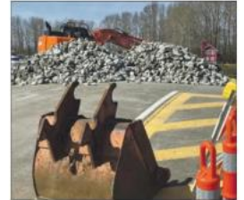
The city last week started removing the falling Brackman-Ker deck on Chisholm Street.

That building was one of three granaries constructed at Chisholm and Georgia streets in the 1890s, across the street from the Brackman-Ker warehouse.