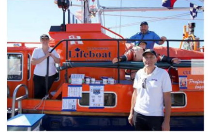
The 22nd annual Richmond Maritime Festival drew crowds out to Britannia Shipyards National Historic Site in Steveston on Aug. 23 and 24, 2025.

This year was the 22nd annual Richmond Maritime Festival and it offered lots of fun activities combined with learning about our nautical history. The event took place at Britannia Shipyards National Historic Site in Steveston this past Saturday and Sunday.