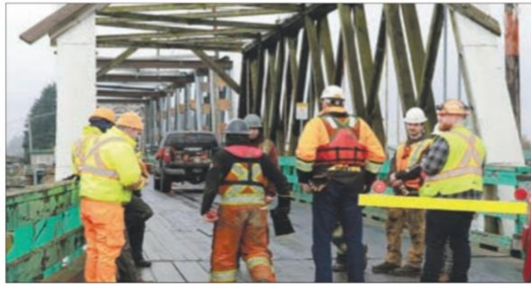
DELTA OPTIMIST FILE

Wanting to participate in the engagement process, the DFI's submission includes a request for TransLink to also implement protective pilings, independent of the bridge, to