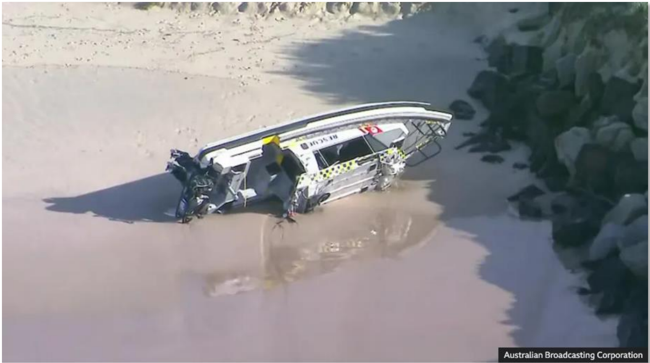
The Marine Rescue NSW boat which flipped in the water en route to a yacht rescue

Three people have died, including two volunteer rescuers, after a yacht sank and a rescue boat rolled in choppy conditions off Australia's New South Wales (NSW) coast.